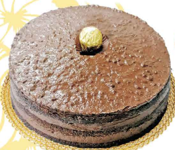
WHITE CHOCOLATE EXPLOSION