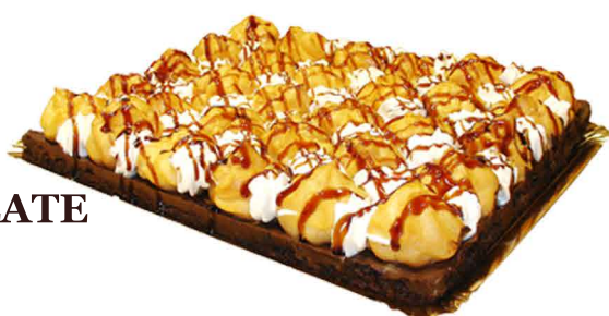
CHOUX & CHOCOLATE