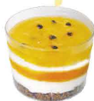
TROPICAL MANGO & PASSION FRUIT