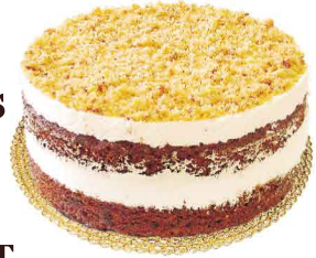
CARROT & NUTS