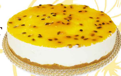
PASSION FRUIT CHEESECAKE