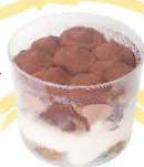
TIRAMISÚ NUTELLA & MASCARPONE