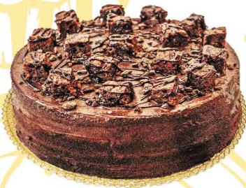
2 CHOCOLATES & BROWNIE