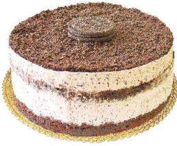
CHOCOLATE & CREAM