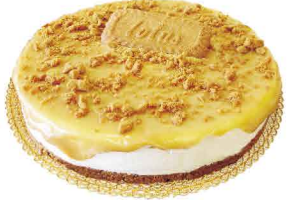
LOTTUS BISCUIT & SWEET MILK