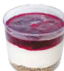
RED FRUITS CHEESECAKE