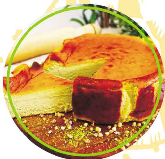
novelty CREAMY PISTACHIO CHEESE CAKE