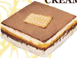
COOKIE & CHOCOLATE