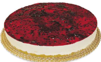
RED FRUITS CHEESECAKE