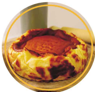
VILLAGE CREAMY CHEESE CAKE