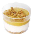
LÓTTUS BISCUIT & SWEET MILK