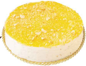
BISCUITS & CUSTARD CREAM DELICASSY