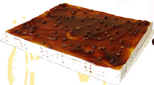
CARAMEL & COOKIE