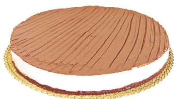
nutella CHEESECAKE CHOCNUTELLA