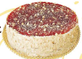
CARAMEL & COOKIE