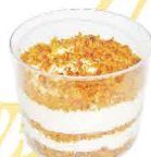
CARROT & NUTS