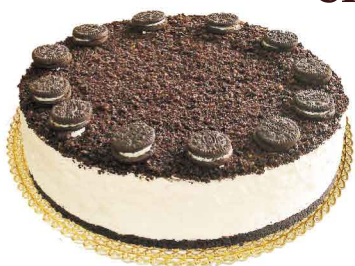
OREO ÓREOOO CHEESECAKE